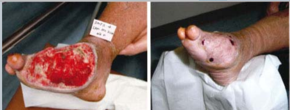
Figure 3a: Diabetic foot ulceration before and after herbal treatment.