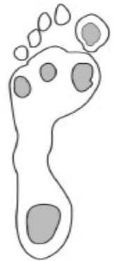
Figure 2: Shaded areas of the sole represent the at-risk pressure points.

D. The reverse flap is tunneled through a skin bridge to be laid onto the heel defect.